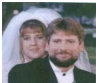
FRONT of CD

2 FREE CDs with PLATINUM PACKAGE Additional CDs $15.00 Each